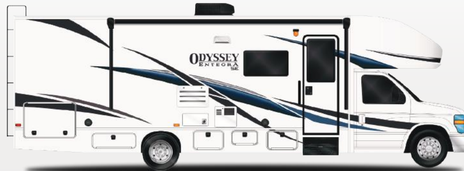
Standard Partial Paint